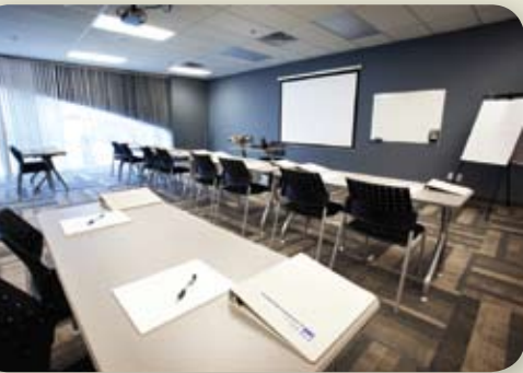
In-house training centre at the CGIS Edmonton Automation and Service Centre.

With over 30 years of experience in the valve industry, CG Industrial Specialties Ltd. (CGIS) provides unmatched experience and expertise by recommending the best possible valve at the lowest possible cost of ownership.