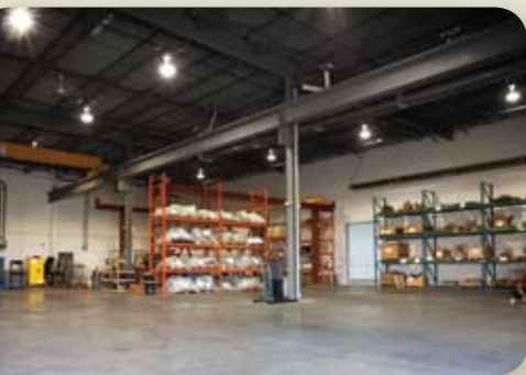
Our 16,000 square foot warehouse facility at the CGIS Edmonton Automation and Service Centre.